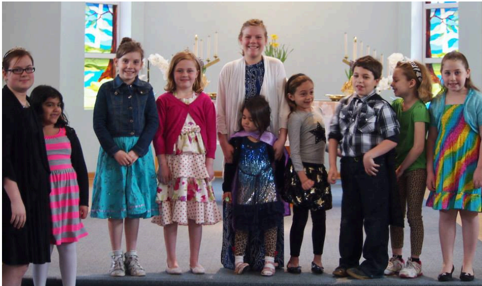
The God Squad